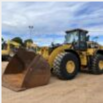
2019 CATERPILLAR 980M WHEEL LOADER | Stock No. 6/8490

Make/Model Komatsu / Condition Used Location Midland, WA PC138US-8 Hours 3563 Year 2018 Price $POA Features AC ROPS Cabin, Beacon, Boom Check Valve, GP Bucket, Handrails, Push Blade, Quick Hitch, Reverse Camera, Stick Check Valve