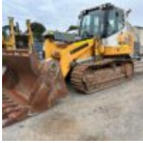
2014 LIEBHERR LR634 CRAWLER LOADER | Stock No. 6/8611

Make/Model Liebherr / LR634 Condition Used Location Penrith, NSW Hours 7220 Year 2014 Price $POA Features A/C ROPS Cabin, Battery Isolation Switch, Beacon, E Stops, Multi-Purpose (4in1) Bucket – trash Rack), Reverse Alarm – Squawker, Serviced, Undercarriage – worn (sprocket 25-30%, chains & idlers), Work Lights, Work Ready