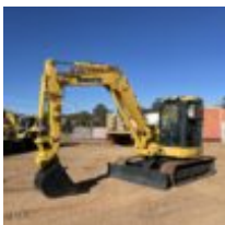
2016 KOMATSU PC88MR-8 EXCAVATOR | Stock No. 6/8236

Make/Model Hitachi / ZX85USB-5A Condition Used Location Midland, WA Hours 3944 Year 2015 Price $POA Features A/C ROPS Cabin, Auxiliary Hydraulics, Boom Check Valve, Push Blade, Quick Hitch, Reverse Camera, Stick Check Valve