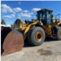
2015 CATERPILLAR 966M XE WHEEL LOADER | Stock No. 6/7867

Make/Model Liebherr / LR634 Condition Used Location Penrith, NSW Hours 7220 Year 2014 Price $POA Features A/C ROPS Cabin, Battery Isolation Switch, Beacon, E Stops, Multi-Purpose (4in1) Bucket – trash Rack), Reverse Alarm – Squawker, Serviced, Undercarriage – worn (sprocket 25-30%, chains & idlers), Work Lights, Work Ready