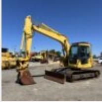
2018 KOMATSU PC138US-8 HYDRAULIC EXCAVATOR | Stock No. 6/8240

Make/Model Caterpillar / 990K Condition Used Location Penrith, NSW Hours 11670 Year 2017 Price $POA Features A/C ROPS Cabin, GP Radio, Retarder, Ride Control, Rock Bucket, Secondary Steering, Tc, Td