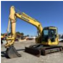
2018 KOMATSU PC138US-8 HYDRAULIC EXCAVATOR | Stock No. 6/8241

Make/Model Komatsu / Condition Used Location Midland, WA PC138US-8 Hours 3932 Year 2018 Price $POA Features A/C ROPS Cabin, Auxiliary Hydraulics, Battery Isolator, Boom Check Valve, EStops, GP Bucket, Handrails, Push Blade, Quick Hitch, Reverse Camera, Stick Check Valve