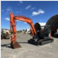
2015 HITACHI ZX85USB-5A HYDRAULIC EXCAVATOR | Stock No. 6/8238

Make/Model Caterpillar / 988K H/L Condition Used Location Midland, WA Hours 28801 Year 2015 Price $595,000 + GST Features 2015 Built/Delivered 2016, A/C ROPS Cabin, Auto Lube, Fire Suppression, Hand Rails, High Lift, Rebuilt Transmission and Torque Converter