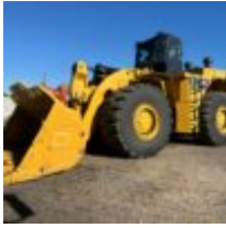
2017 CATERPILLAR 990K WHEEL LOADER | Stock No. 6/8192

Make/Model Caterpillar / 990K Condition Used Location Penrith, NSW Hours 11670 Year 2017 Price $POA Features A/C ROPS Cabin, GP Radio, Retarder, Ride Control, Rock Bucket, Secondary Steering, Tc, Td