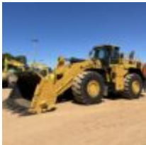
2015 CATERPILLAR 988K H/L WHEEL LOADER | Stock No. 6/988KHL

Make/Model Caterpillar / 966M XE Condition Used Location Penrith, NSW Hours 11105 Year 2015 Price $POA Features AC ROPS Cabin, Auto Lube, Battery Isolator, Beacon, E Stops, Fire Extinguishers, GP Bucket - Straight Edge, LED Lights, Reverse Camera, Ride Control, Road Fenders, Standard Lift, Supp Steering, Tier 4, UHF Radio