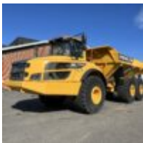
2020 VOLVO A40G ARTICULATED DUMP TRUCK | Stock No. 6/8500

Make/Model Caterpillar / 980M Condition Used Location Midland, WA Hours 5055 Year 2019 Price $POA Features 29.5R25 Tyres, A/C ROPS Cabin, Battery Isolator, Beacon, Joy Stick Control, Junpstart Receptable, Loadrite with Printer, Reverse Camera, Spade Nose Bucket 7.0m3 with BOE, Tier 4