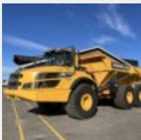
2020 VOLVO A40G ARTICULATED DUMP TRUCK | Stock No. 6/8501

Make/Model Volvo / A40G Condition Used Location Midland, WA Hours 4176 Year 2020 Price $POA Features 29.5R25 Tyres, A/C ROPS Cabin, AdBlue, Battery Isolator, Beacon, E Stops, USB Radio, Wheel Chocks